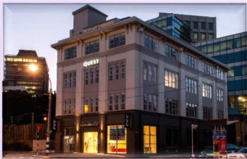
QUEST ON THORNDON

This beauty which was completed in late 2014 is now operational and trading at full capacity. There are 4 units remaining as well as the ECC retail unit now available so be quick to secure an investment opportunity in Wellington that will line your pockets with growth for years to come.