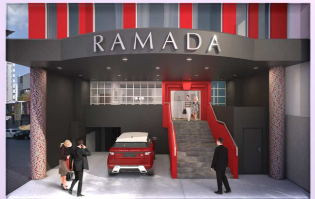
RAMADA ON FEDERAL STREET, AUCKLAND

Construction started on 7 th April at Ramada on Federal Street with building consent being processed and works to be commencing with approval for early fit-outs.