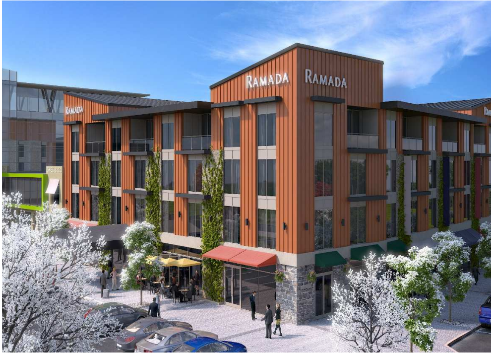
OUR LATEST DEVELOPMENT